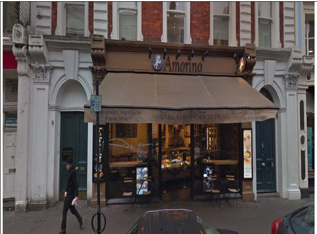
7 Garrick Street